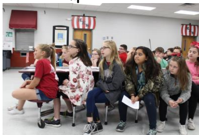
An intent audience....