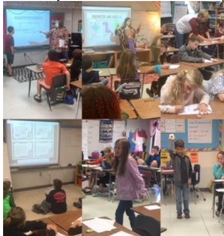
Earth Day speakers came to visit with 5th grade!